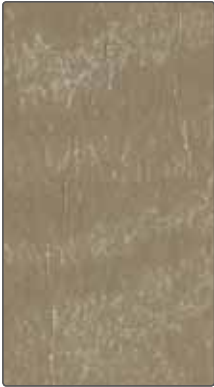
Shadow Silky SILKY