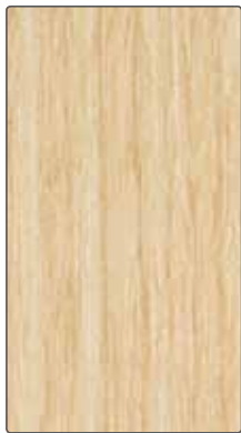
Darkar Bright WOOD MATT