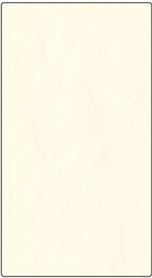
Frosty White HONED