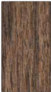
Valencia Walnut WOOD MATT