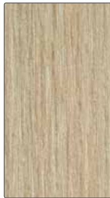
Natural Ash WOOD MATT