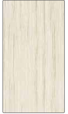
Treviso Oak WOOD MATT