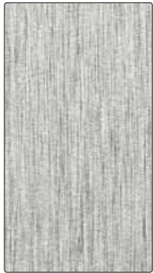
Brushed Aluminium HIGH WEAR