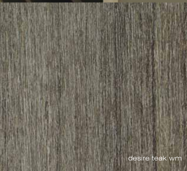
desire teak wm