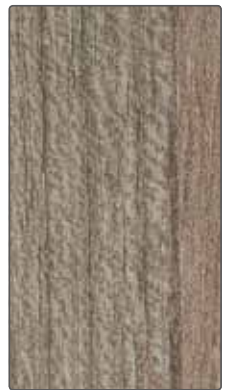
Teak WOOD MATT