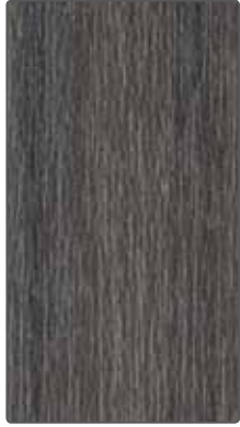
Tulip Smoke WOOD MATT