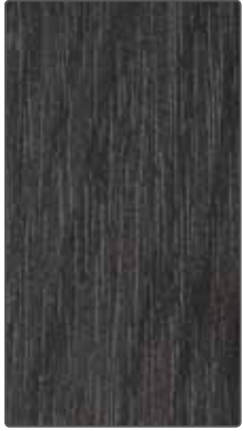
Erable Wenge WOOD MATT