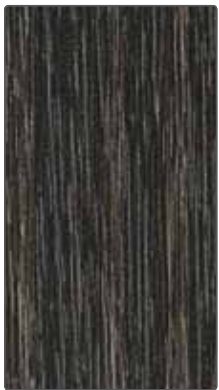
Congratti Wood WOOD MATT