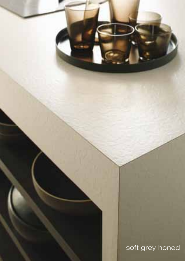
soft grey honed