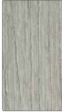
Silver Ash WOOD MATT