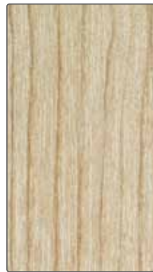
Atlanta Cherry WOOD MATT