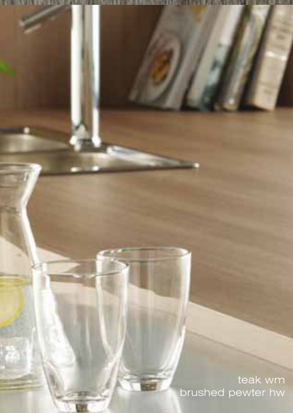
teak wm brushed pewter hw