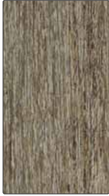
Desire Teak WOOD MATT