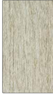
Cool Teak WOOD MATT